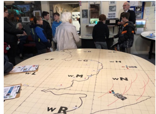
The large map table, known as the "Fighter and General Situation Table". This was used to collate enemy targets, and then organise fighter squadrons to intercept them.

YAC members were also allowed to explore the Cold War Command Centre: As well as being allowed to press numerous buttons, switches and controls, members were able to have a go at writing on the "Tote boards". These were used by crews in the Operation Room to record positions of aircraft and missions. They were back lit, unlike modern screens, so users had stand behind them and write the information backwards. Some of our members had a go!