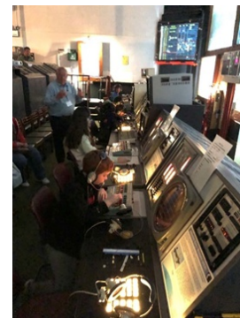
Cold War Operations Room