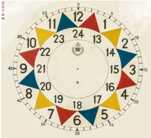
The Sector Clocks were divided into coloured sections, each showing 5 minute intervals, which corresponded to coloured arrows on the large circular map tables.

On 6th July 2024 members of the Young Archaeology Club visited RAF Neatishead. They were able to explore the various historic displays and exhibits, including sitting in the cockpit of a Tornado and Jaguar and were given two presentations by Museum Volunteers in the WW2 Radar Control Room and Cold War Operations Room. The development of Radar was explained, along with how the data was used to chart the movement of aircraft during WW2, including during the Battle of Britain. Members learnt that staff in the RAF Operations Room could interpret signals from Radar, then used a Sector Clock to aid the chronological monitoring and position plotting of German aircraft.